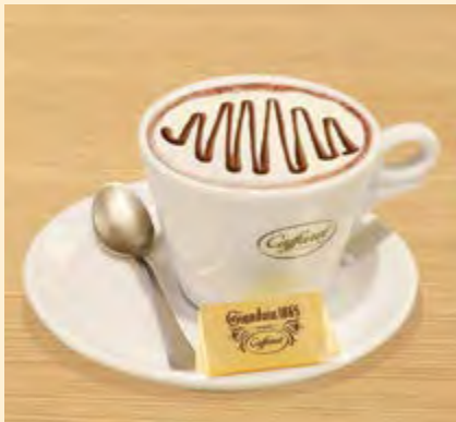
Personalization of coffee, marocchino, latte macchiato and to create drinks with a unique and persistent flavour.