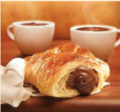
After baking (croissants, crêpes); before baking (cakes, curd tarts, pizzas).