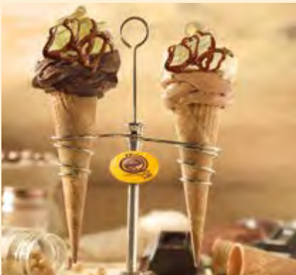
Ice cream cone and cup, frozen yogurt decoration/variegation.